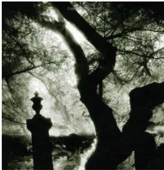
Charles Dickens Great Expectations

The texts we will study are Great Expectations, Macbeth, An Inspector Calls and poetry from the 'Power and Conflict' anthology.